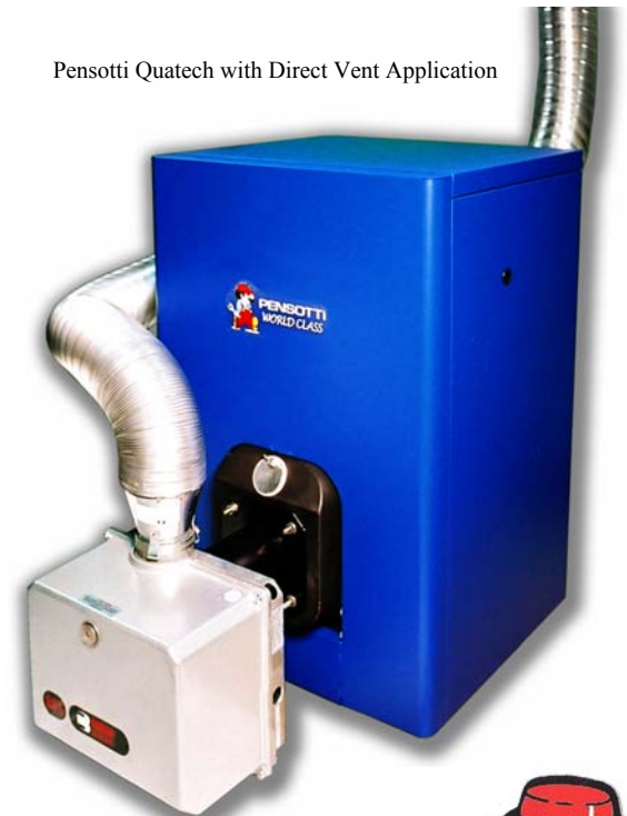
Pensotti Quatech with Direct Vent Application

Pensotti direct vent kits come complete with vent pipe, appliance adapter, terminal adapter, terminal, Flexible air intake, intake clamp, burner air adapter, and CeraFlex sealant.