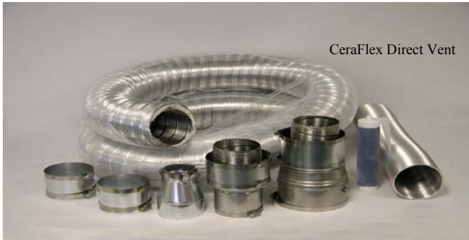
CeraFlex Direct Vent