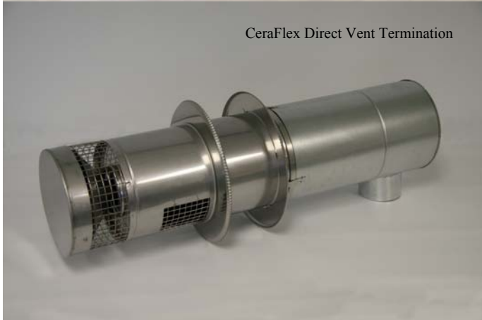
CeraFlex Direct Vent Termination